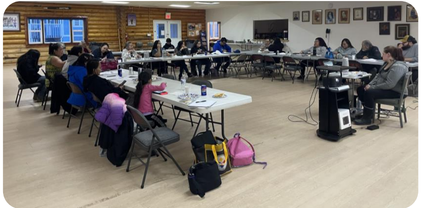
Tribal Members at the 10-Year Strategic Planning Meeting on 2/26/2025